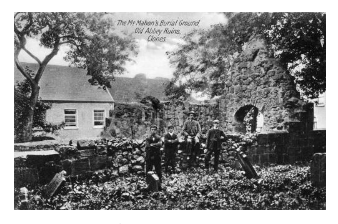
The McMahon's Burial Ground, Old Abbey Ruins, Clones.