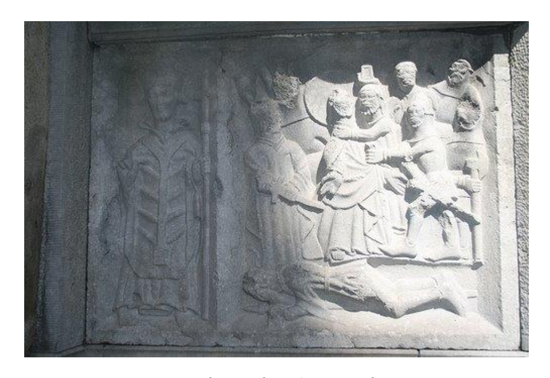
MacMahon Tomb, Ennis, County Clare